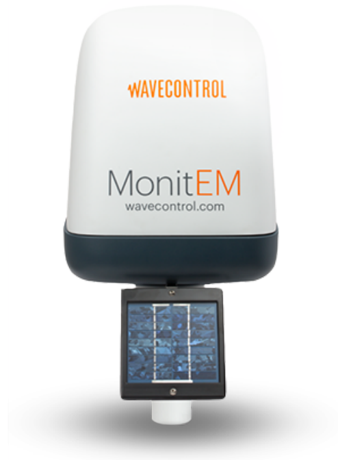
MonitEM Continuous monitoring