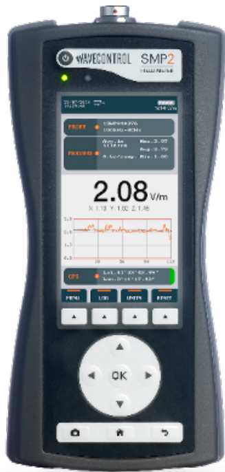
SMP2 EMF / NIR portable meter